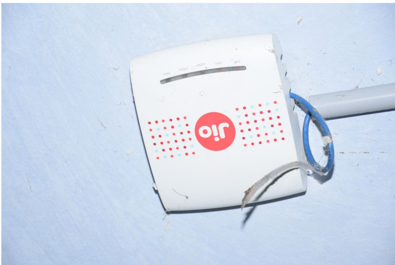
Wi FI Modem in each wing