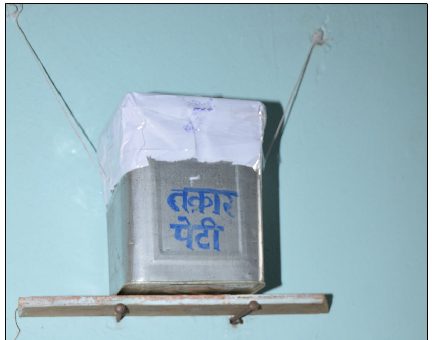
Compliant and Suggestion Box