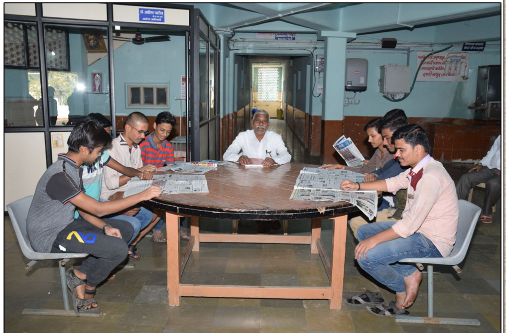
News Paper reading Table